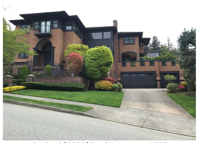
Grade 12/2005/Total Living Area 5,370