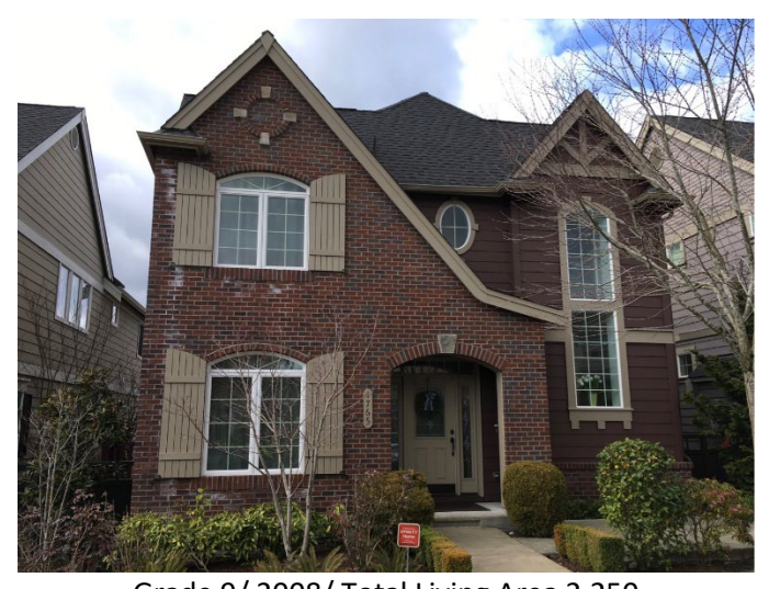
Grade 9/ 2008/ Total Living Area 2,250