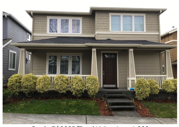
Grade 7/ 2005/Total Living Area 1,890