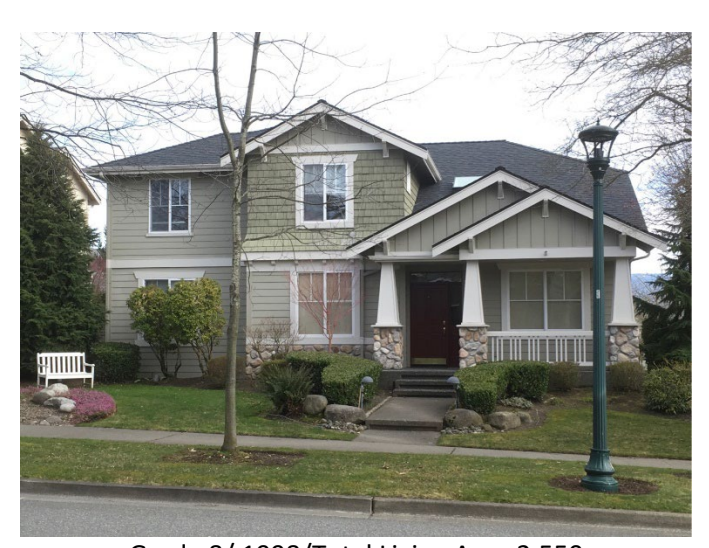
Grade 8/1998/Total Living Area 2,550