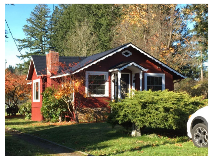
Grade 5/1923/Total Living Area 920