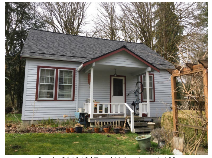
Grade 6/1910/Total Living Area 1,460