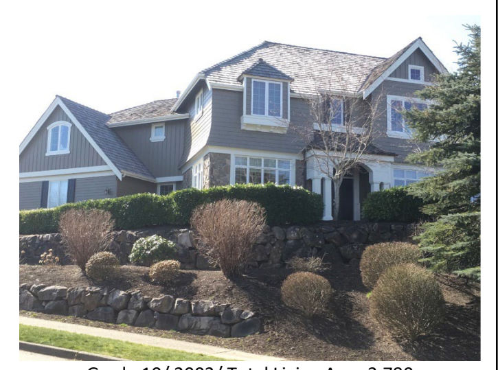
Grade 10/2003/ Total Living Area 3,780

Area 75Error! Reference source not found.