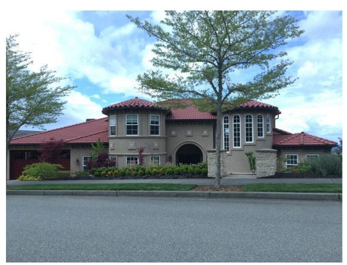
Grade 11/2015/ Total Living Area 4,420