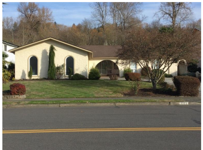
Grade 8 / Year Built 1972 / Total Living Area 1800