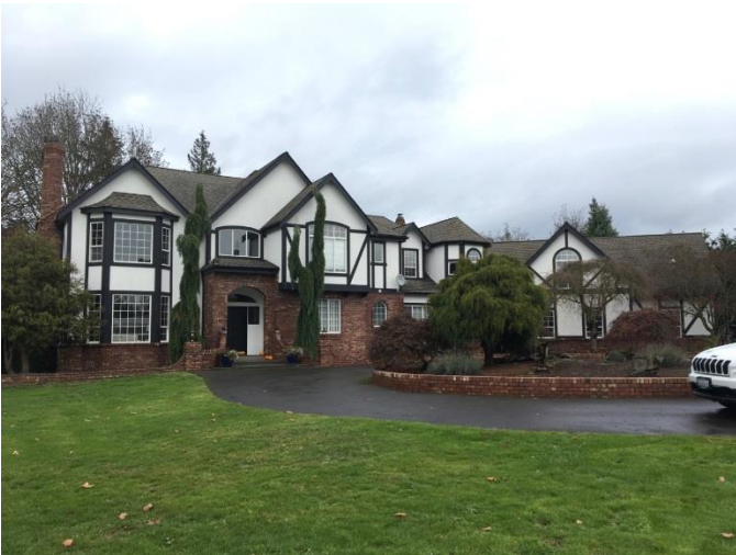
Grade 11 / Year Built 1992 / Total Living Area 5290