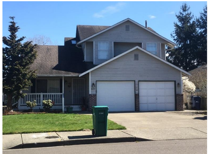
Grade 7 / Year built 1989 / Total Living Area 1700