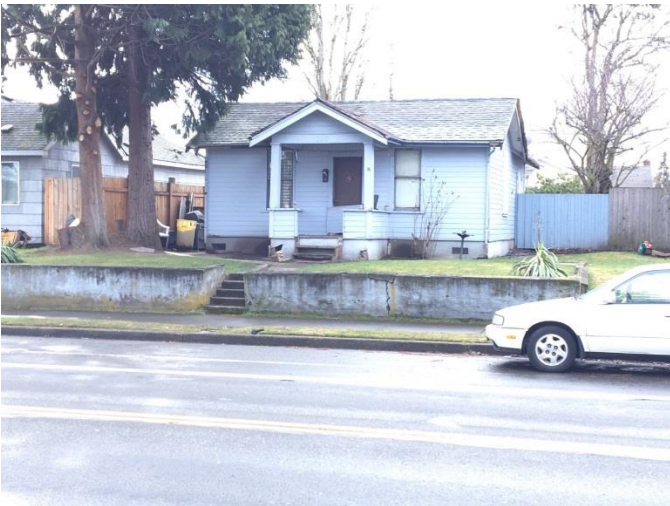
Grade 4 / Year Built 1913 / Total Living Area 580