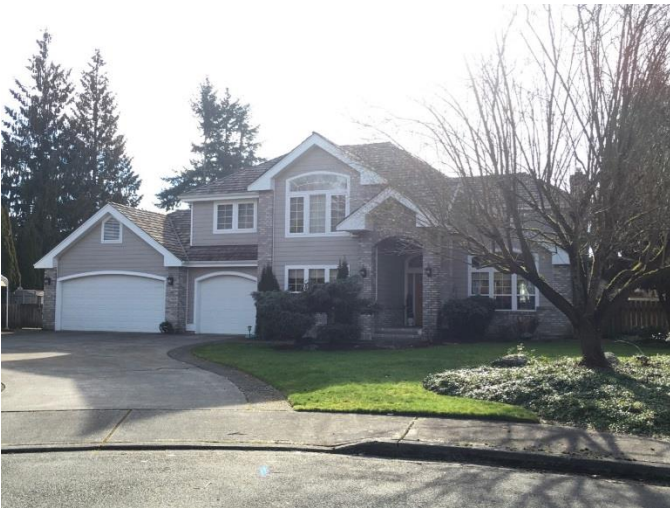
Grade 10 / Year Built 1997 / Total Living Area 3180