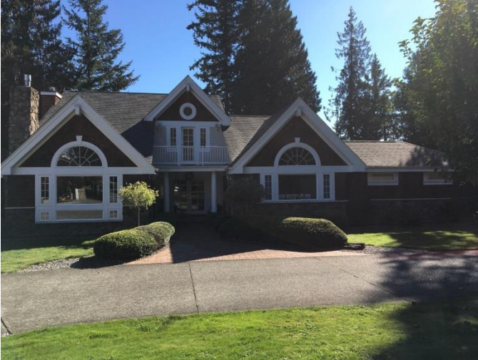
Grade 9 / Year Renovated 1996 / Total Living Area 3589