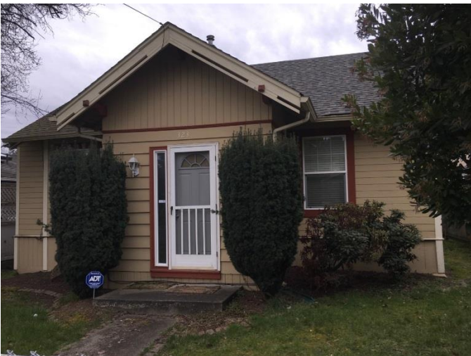
Grade 5 / Year Built 1922 / Total Living Area 820