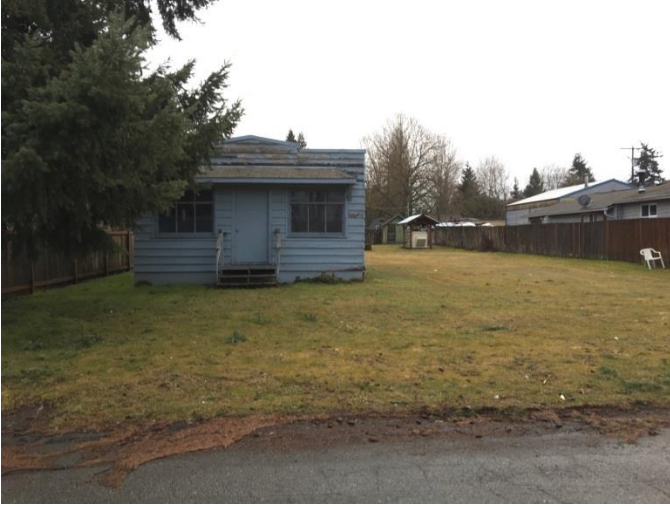
Grade 3 / Year Built 1955 / Total Living Area 520