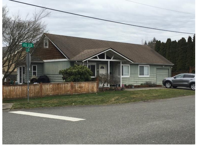
Grade 6 / Year Built 1960 / Total Living Area 1030