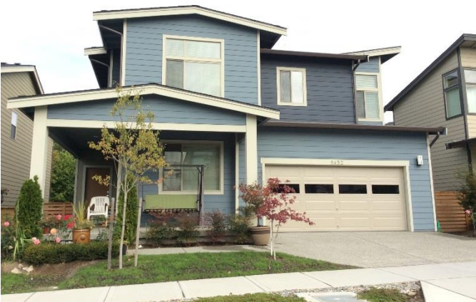
Grade 8/ Year Built: 2015/ Total Living Area: 2,730sf