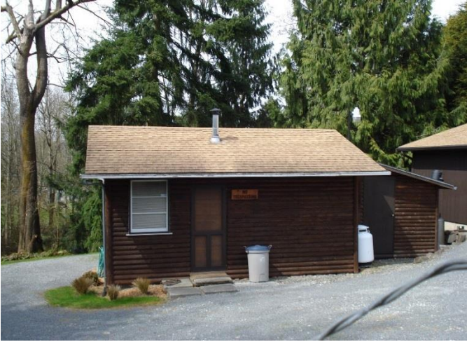
Grade 4/ Year Built: 1966/ Total Living Area: 270sf