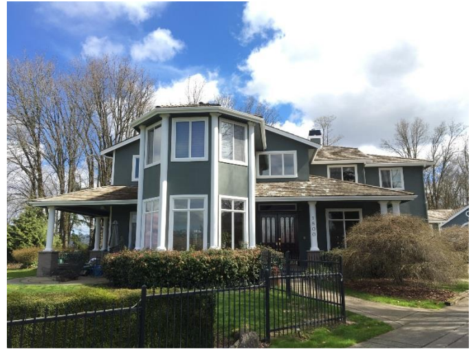
Grade 11/ Year Built: 1995/ Total Living Area: 6,560