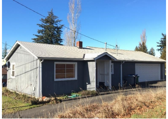
Grade 5/ Year Built: 1953/ Total Living Area: 770sf