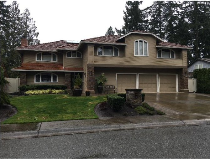
Grade 10/ Year Built: 1968/ Total Living Area: 4,580sf