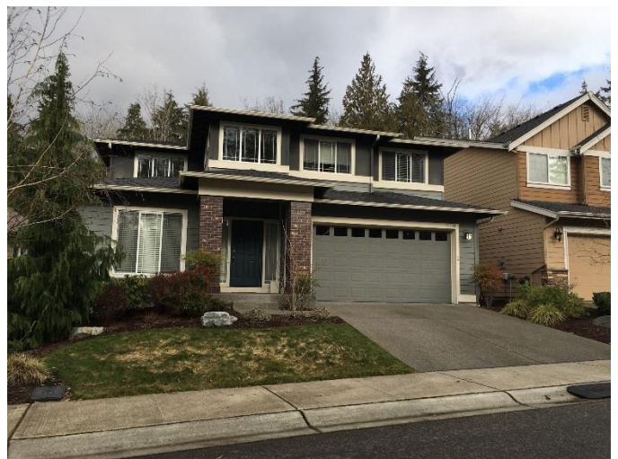
Grade 9/ Year Built: 2011/ Total Living Area: 2,650sf