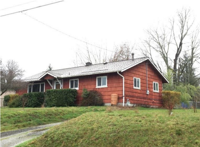
Grade 6/ Year Built: 1948/ Total Living Area: 1,270sf