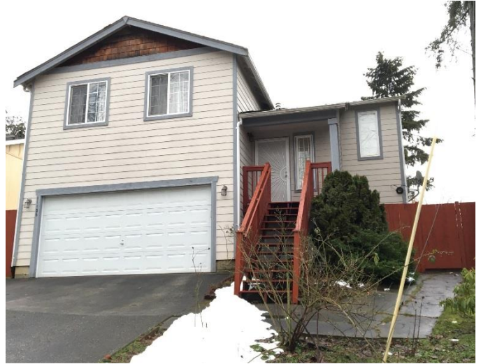
Grade 7/ Year Built: 2002/ Total Living Area: 1,900sf