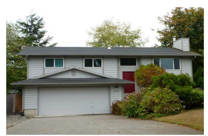
Grade 7/ Year Built 1980/ TLA 1,820