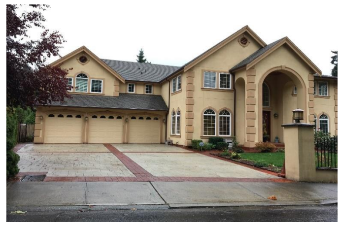
Grade 11/ Year Built 2006/ TLA 4,570