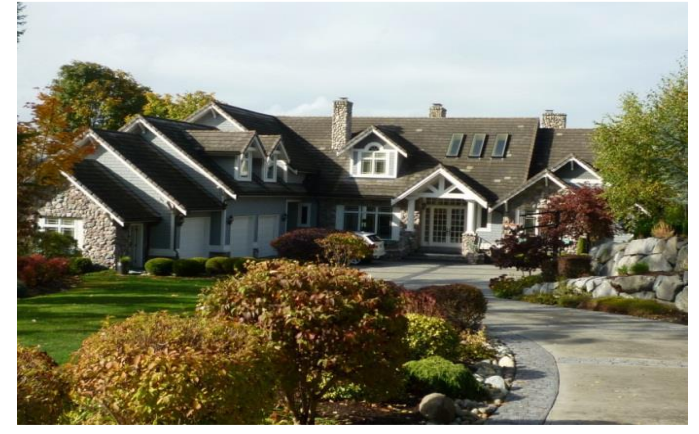
Grade 13/ Year Built 2000/ TLA 5,580