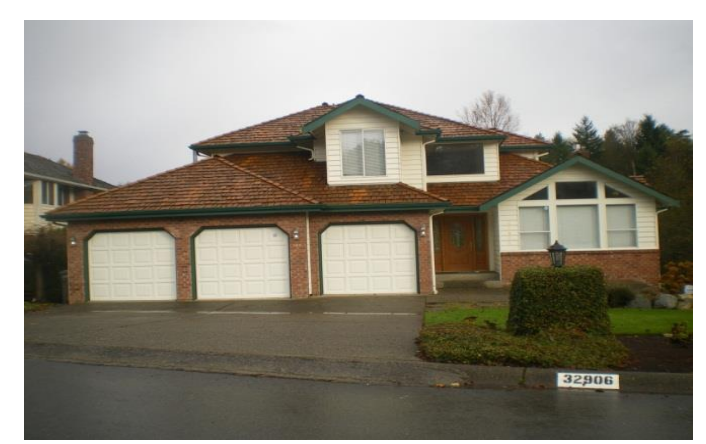
Grade 9/ Year Built 1990/ TLA 3,890