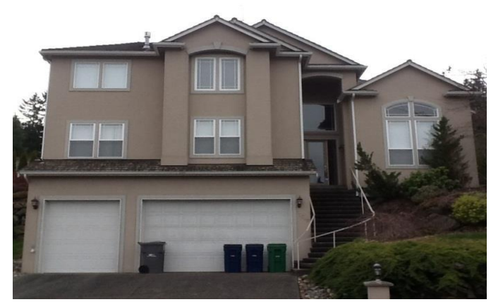
Grade 10/ Year Built 1999/ TLA 3,670