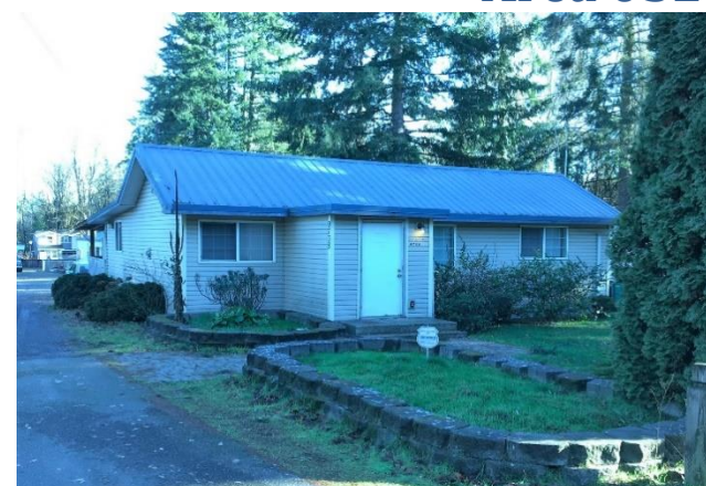
Grade 5/ Year Built1942/ TLA 1,060