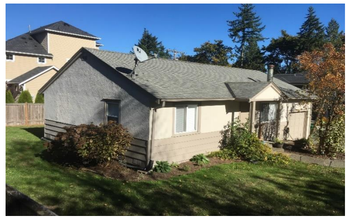
Grade 6/ Year Built 1955/ TLA 950