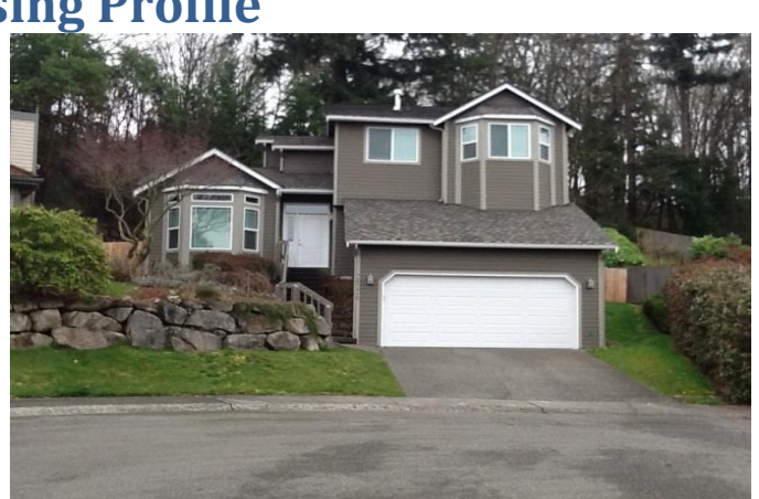
Grade 8/ Year Built 1980/ TLA 1,730