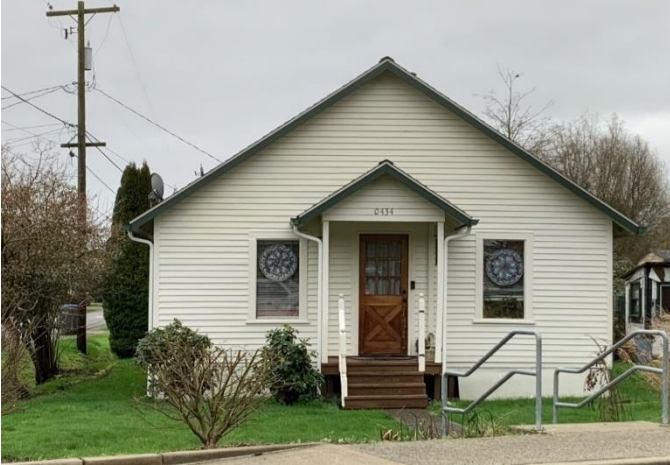
Grade 4/ Year Built 1937/ 960sf Total Living Area