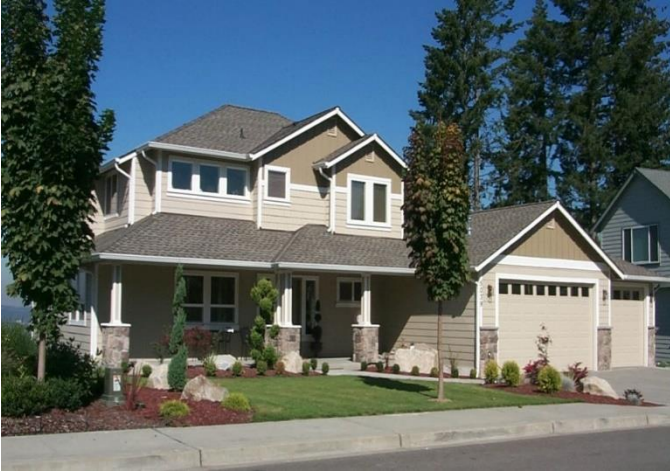
Grade 10/ Year Built 2005/ 3,620sf Total Living Area