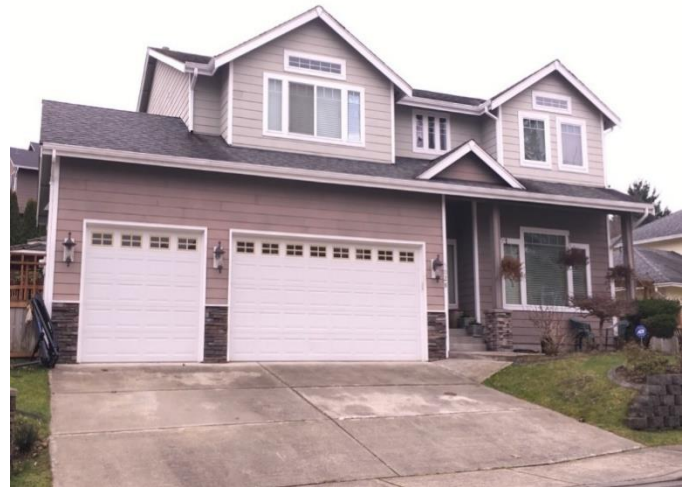
Grade 8/ Year Built 2002/ 2,650sf Total Living Area