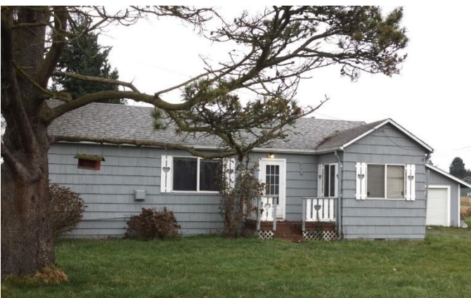
Grade 6 / Year Built 1945 / 1,260sf Total Living Area