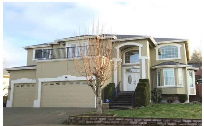
Grade 9/ Year Built 2004/ 3,130sf Total Living Area