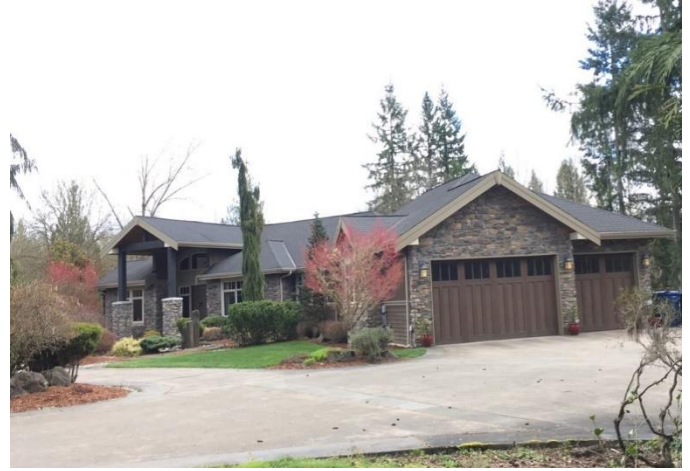
Grade 11 / Year Built 2006 / 4,490sf Total Living Area