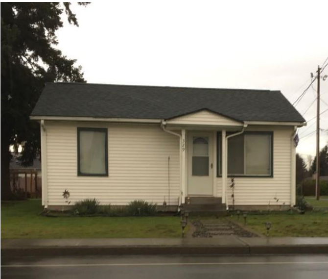
Grade 5/ Year Built 1956 / 630sf Total Living Area