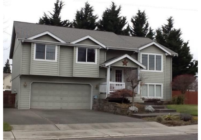
Grade 7/ Year Built 1996/ 1,980sf Total Living Area