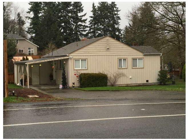
Grade 6 / 1965 Year Built / Total Living Area 890 SF