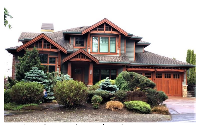
Grade 11 / Year Built 2007 / Total Living Area 5840 SF