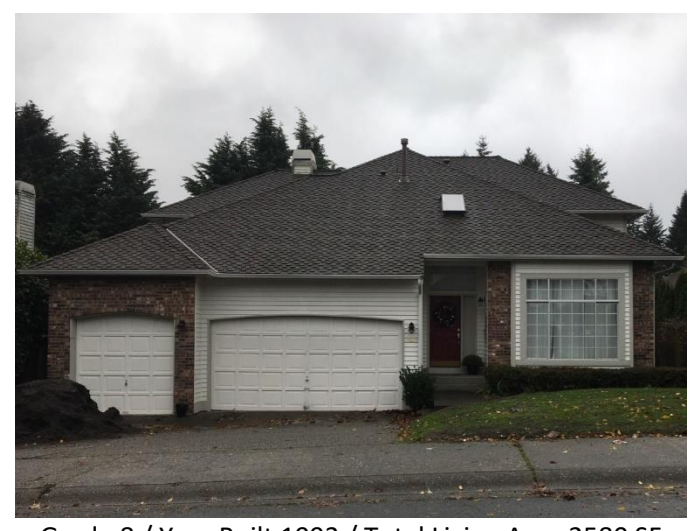
Grade 8 / Year Built 1993 / Total Living Area 2580 SF