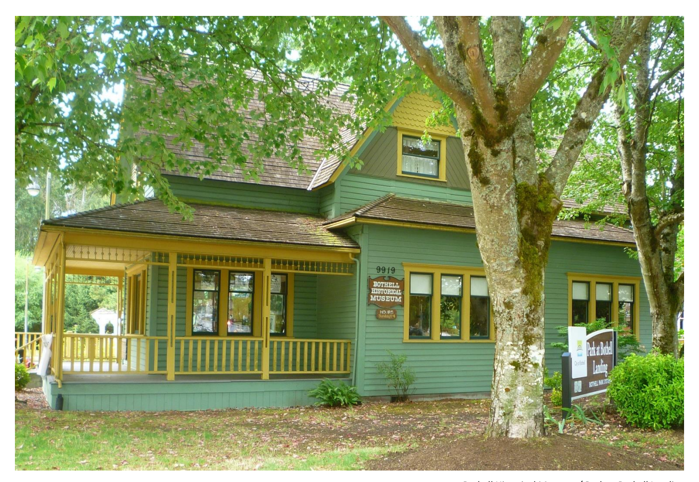
Bothell Historical Museum / Park at Bothell Landing