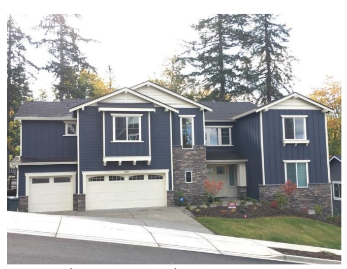
Grade 9/ Year Built 2018 / Total Living Area 3670 SF