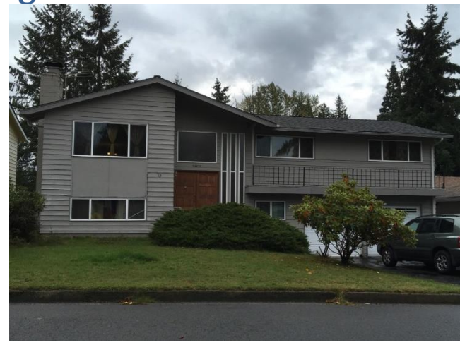
Grade 7/ Year Built 1968 / Total Living Area 1620 SF