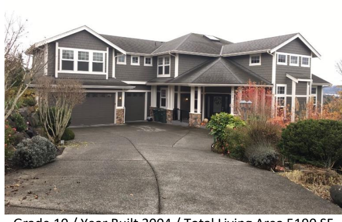
Grade 10 / Year Built 2004 / Total Living Area 5190 SF