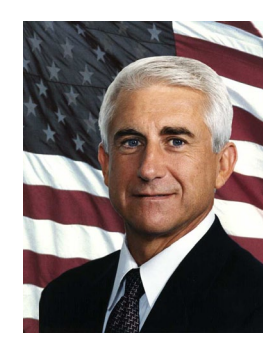
Dave Reichert (Prefers Republican Party)

Elected Experience: King County Sheriff, 1997-2004, House of Representatives, 2005-Current