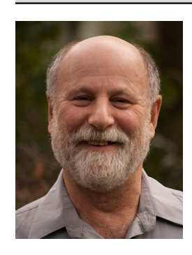
Adam Kline (Prefers Democratic Party)

Elected Experience: 14 sessions as your State Senator.