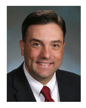
Jay Rodne (Prefers Republican Party)

Elected Experience: State Representative, Washington House of Representatives (2004-present); Snoqualmie City Council (2001-2004)