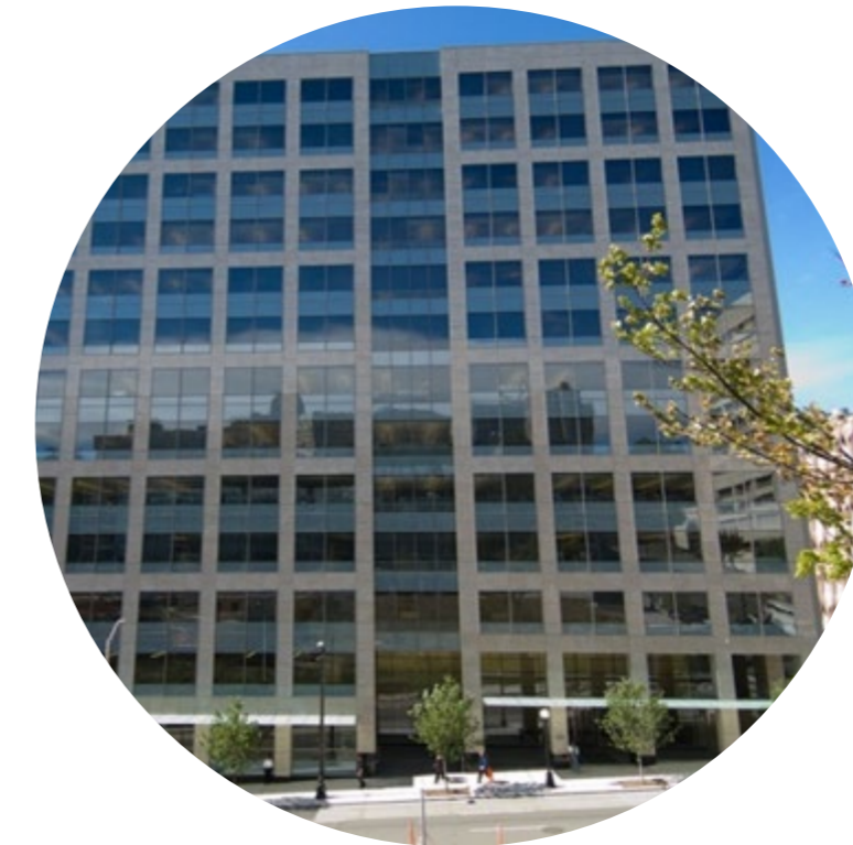
Best Run Government