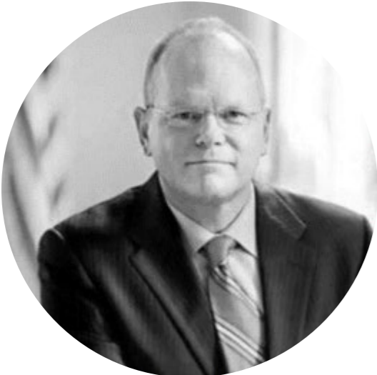
DAN SATTERBERG KING COUNTY PROSECUTING ATTORNEY