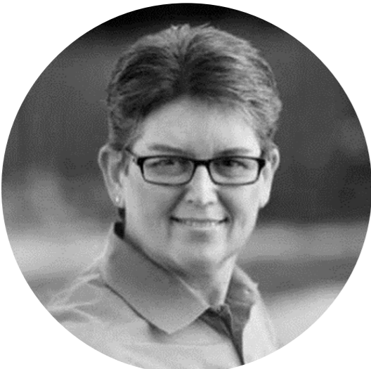
MITZI JOHANKNECHT KING COUNTY SHERIFF