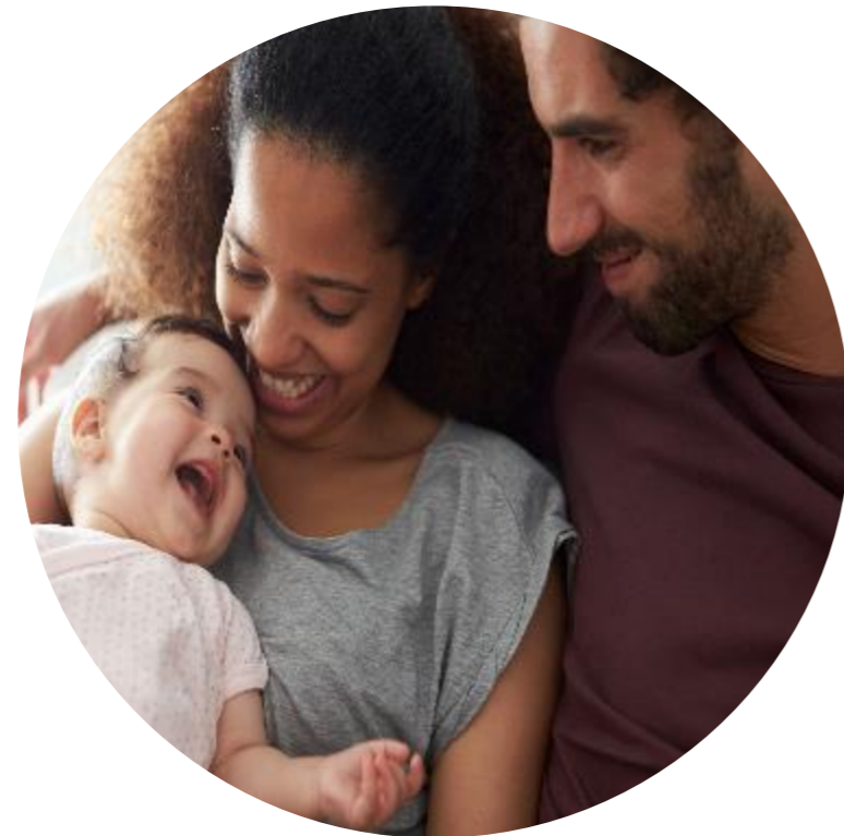
Best Starts For Kids