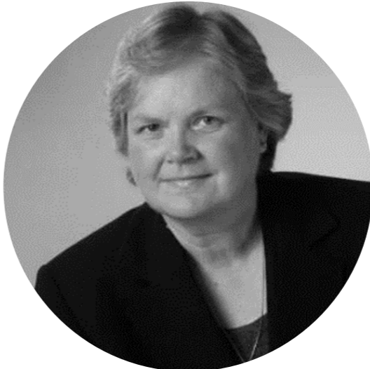
DONNA TUCKER KING COUNTY DISTRICT COURT PRESIDING JUDGE