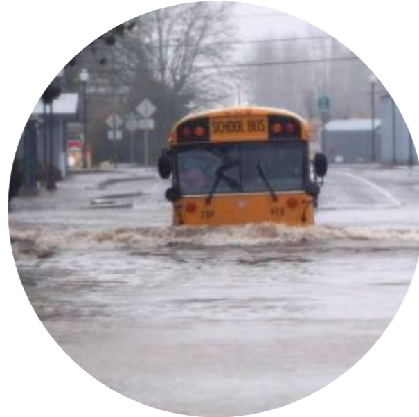
Flooding / Winter Storms