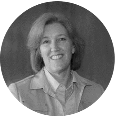
TRACYE CANTRELL INTERIM CTO CITY OF SEATTLE