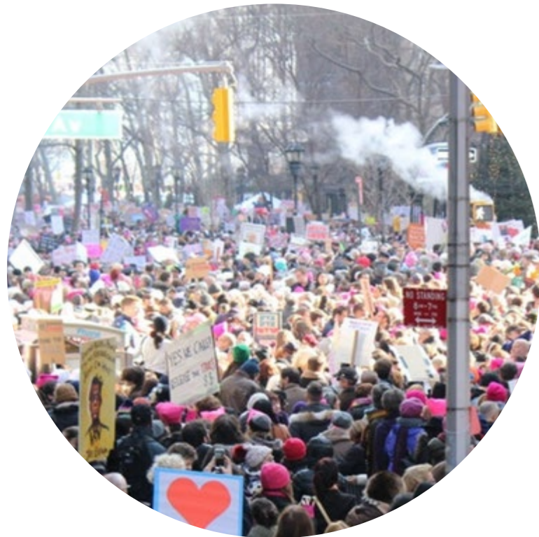
Equity and Social Justice