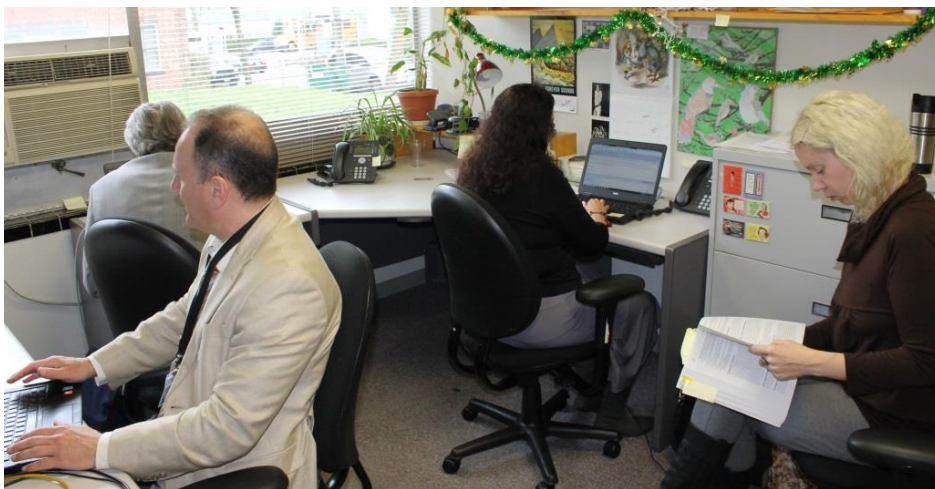
Three attorneys and a social worker from ACA's civil commitment unit share a crowded office some mornings.

forcing public defenders to travel to four – soon to be five – hospitals. This has raised a new and equally challenging set of issues. The hospitals have created video courtrooms, but confidential rooms – where attorneys can talk to their clients or family members – are at a premium. In some instances, the client is in a shared room, and attorneys either have to whisper to their client or ask