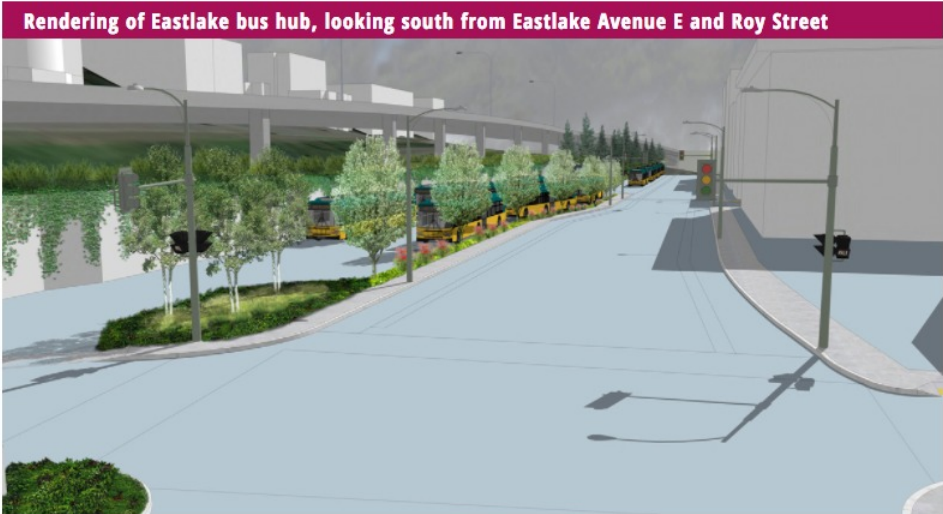
CLICK AN IMAGE TO SEE A LARGER VIEW.