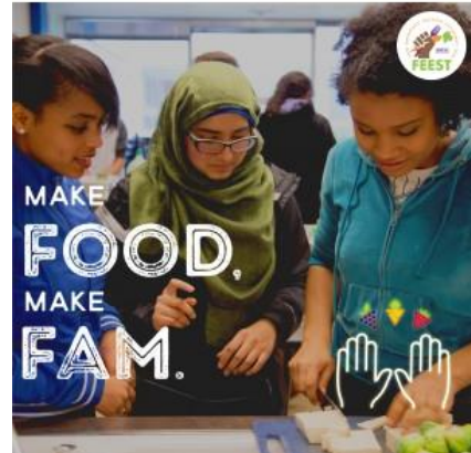
[Image Description: A photo of two young women looking on while a third cuts food with a knife. Superimposed on the photo are the words "Make Food, Make Fam." as well as a FEEST logo and 2 hands with some produce]

After a year of campaign development, FEEST's youth-led counter marketing campaign launched with bus ads, social media ads, stickers, and a display at Dub Sea Coffee in Delridge. Read more here .