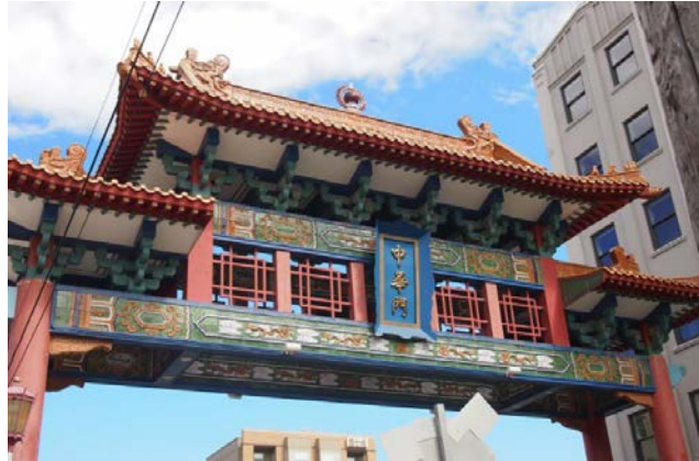
[Image Description: A photo of the top of the Chinatown Gate in the Chinatown-International District]