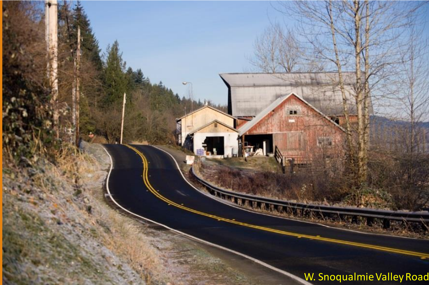
W. Snoqualmie Valley Road

Road Safety and Agricultural Land Preservation