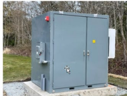
Samish Battery Storage Installed 2023 50 kW / 336 kWh