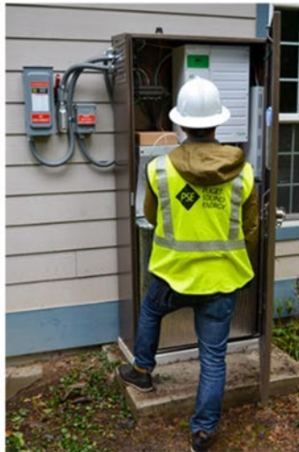
Bainbridge Island Residential Pilot Installed 2019 6 kW / 15.5 kWh