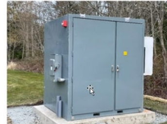
Samish Battery Storage Installed 2023 50 kW / 336 kWh