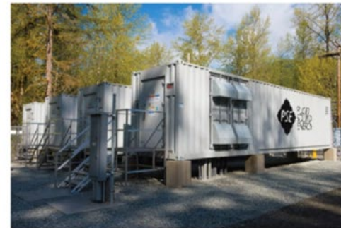
Glacier Battery Storage Installed 2015-2016 2 MW / 4.4MWh