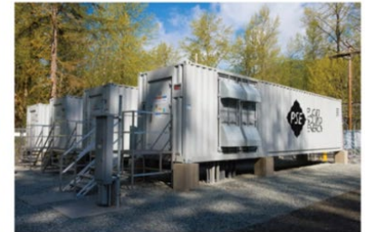
Glacier Battery Storage Installed 2015-2016 2 MW / 4.4MWh