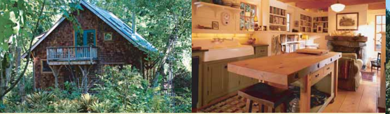
JAS Design Build