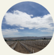
Soil Health Mythbusting

Feb. 13 th , 12 pm – 4 pm PST WSU Prosser or anywhere online