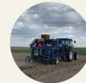
Long-Term Soil Health Research

Feb. 20 th , 8 am – 12 pm PST Lincoln Co. Fairgrounds or anywhere online