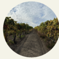
Cover Crop Research: Where are We At?

Incentive Opportunities Producer Panel Emerging Soil Health Ideas