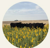
Integrated Dryland Systems

Multi-function Crops (Cover Crops) Producer Panel Carbon Credits