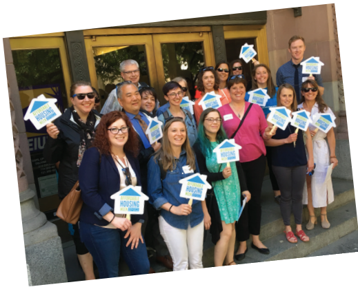
With housing supporters at the 2018 Affordable Housing Week rally.