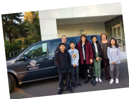
Staff and members of the Boys & Girls Clubs of Bellevue receiving a "retired" King County Metro van.