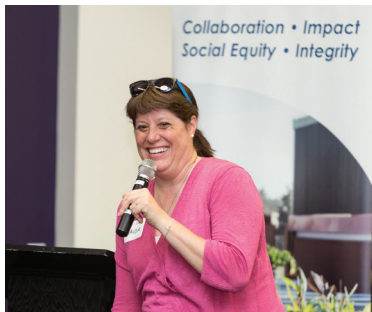
Speaking at the Housing Development Consortium's annual celebration.

PRSRT STD U.S. POSTAGE PAID SEATTLE WA PERMIT NO. 1788