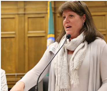
Speaking at the Women Who Lead Forum.

PRSRT STD U.S. POSTAGE PAID SEATTLE WA PERMIT NO. 1788