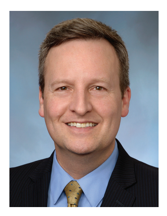
Dave Upthegrove, Chair

As King County Council Chair for 2023, my goal is to show that democracy can work—and that effective and respectful service to the people is possible. The King County Council sets the example as a model for upholding democracy and democratic institutions such as free and fair elections, freedom of the press, independent courts, and the rule of law.