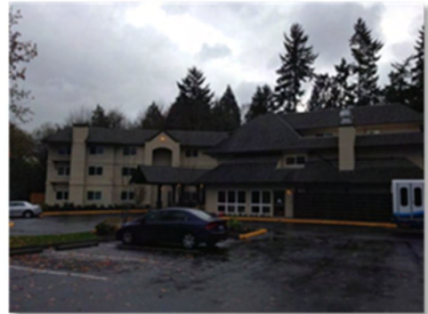
Aegis at Marymoor

555630-0005: Aegis Living at Marymoor, a retirement home, sold on 1/17/2013 for $4,260,680, or $106,517/unit. The property is located in Redmond at the intersection of West Lake Sammamish Parkway Northeast and Northeast Bellevue-Redmond Road. The property was vacant at the time of purchase. The sales price represents the value of the real estate only and does not include consideration for the existing business or personal property. The new owners have completely remodeled the property including all units and common areas.