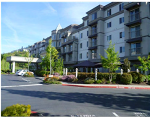
University House - Issaquah

The three most common types of senior housing are congregate seniors housing (independent living), assisted living, and continuing care retirement communities (CCRC). In addition, some assisted living facilities have a special memory care section of the facility for persons with Alzheimer's or other forms of dementia. Full memory care units do not have kitchens and are secure to prevent the residents from wandering on their own. Regulations specify these facilities must provide qualified staff to be present at all times. Although there are no universally accepted standard definitions, retirement facilities can generally be characterized as follows: