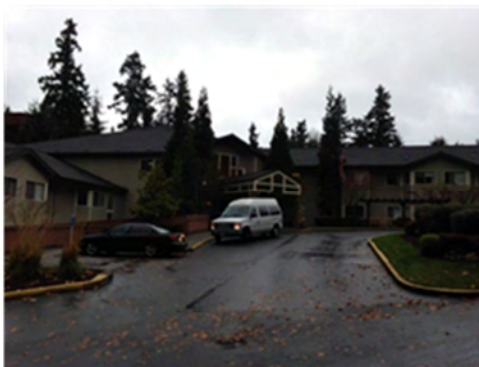
Overlake Terrace Assisted Living

067310-0011: Overlake Terrace Assisted Living retirement home sold on 1/09/2013 for $21,850,000, or $139,172/unit. The property is located in Redmond at the intersection of 152 nd Avenue Northeast and Northeast 31 st Street. Sales price was negotiated and purchased by a property management trust. The sales price includes undisclosed value for the existing business. Overlake Terrace was 85% occupied at time of purchase. The property was then leased to Stellar Senior Living for 15 years with the option to renew. Overlake Terrace was originally offered as part of a portfolio of 12 properties.