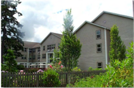
Emeritus at Steel Lake

A brief summary of the six market transactions is provided below: