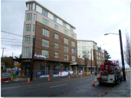
Aegis on Madison

The newest project is Aegis on Madison, owned and operated by Aegis Living. Aegis on Madison is a six-story 102-unit assisted living and memory care community with 1,445 square feet of retail space. The studio and one-bedroom units will feature full kitchens. On-site amenities include a full service dining room, fitness center, activity space and a movie theater. Aegis on Madison is located between the Capitol Hill and Madison Park neighborhoods. Reservations began early in 2014.