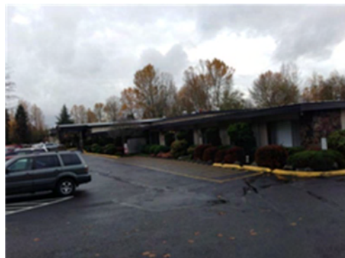
Redmond Care and Rehabilitation Center

Redmond Heights and Redmond Care and Rehabilitation Center were purchased by the same buyer.