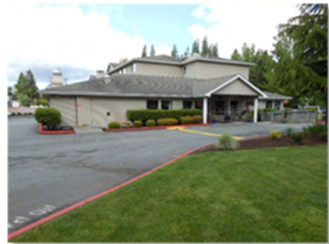
Aegis of Bothell

082605-9127: Aegis of Bothell, a retirement home, sold on 1/21/11 for $7,589,930, or $231/SF of net rentable area. The property is located in Bothell at the intersection of NE 185 th St and Beardslee Boulevard. The Buyer was the tenant at the property and continues to run the facility. Business value was included in the sale price.