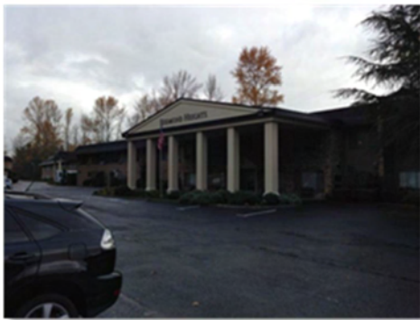
Redmond Heights Senior Living

022505-9157: Redmond Heights Senior Living retirement home sold on 5/01/2013 for $6,567,526, or $65,675/unit. The property is located at the intersection of Willows Road Northeast and Northeast Redmond Way. The sales price included undisclosed business value. The buyer will continue operations as a retirement home.