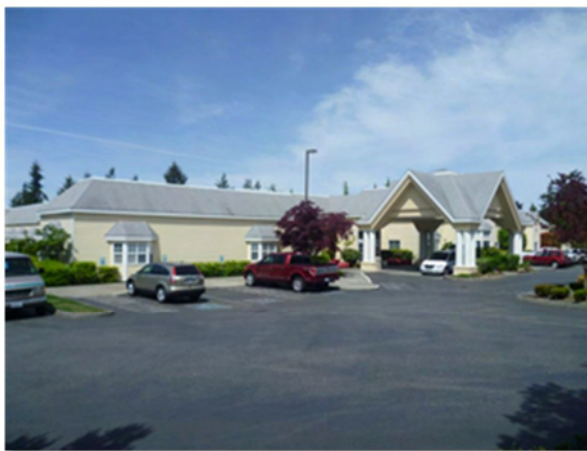
Richmond Beach Rehabilitation

As our population ages, individuals needing continuing skilled nursing care leave the family setting for nursing homes. Individuals recovering from major illness or surgery may also need nursing homes on a temporary basis. Nursing homes provide various levels of health care service on a 24-hour basis in addition to shelter, dietary, housekeeping, laundry, and social needs. Nursing facilities include intermediate, skilled, and sub-acute care. In some cases, nursing homes may be part of a CCRC. Nursing homes are often referred to as convalescent hospitals or rehabilitation facilities.