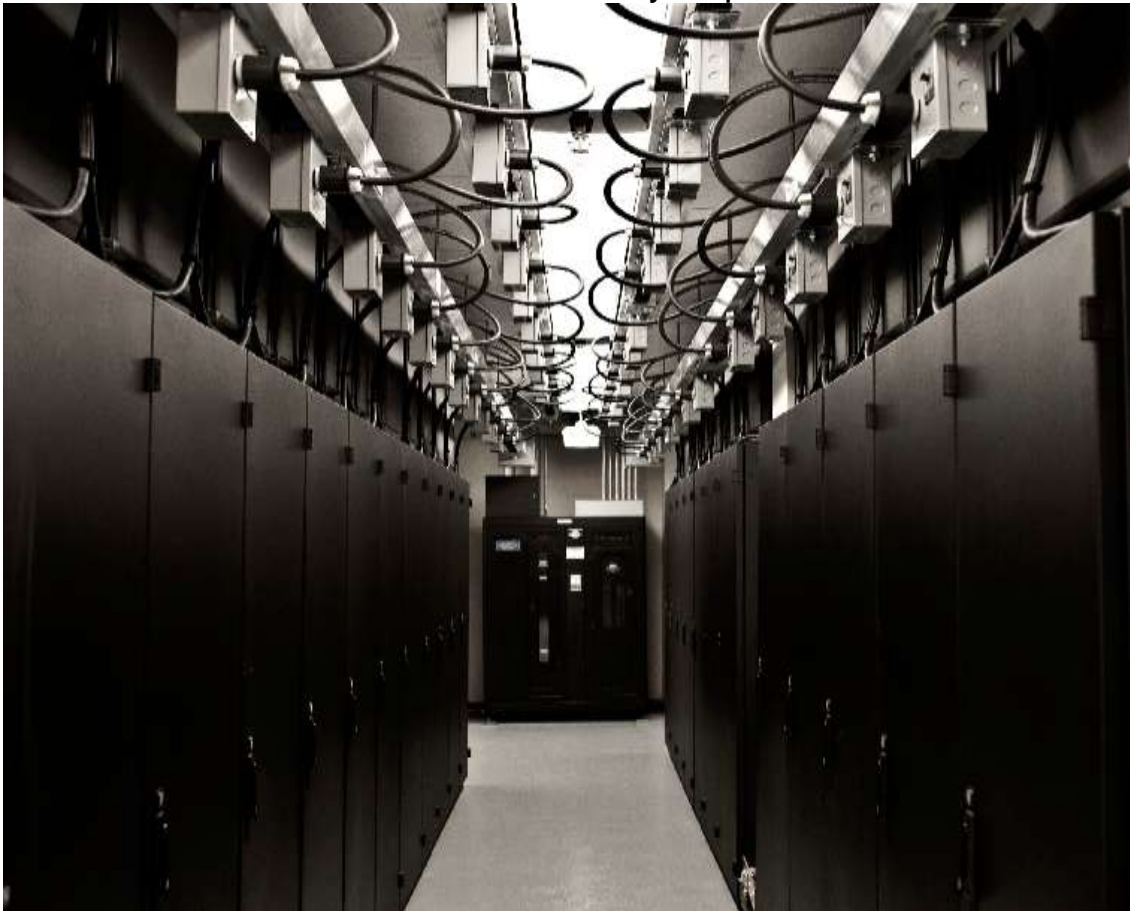
Hot aisle & High voltage distribution panel - King County Data Center

Facilities Management Division & Office of Information Resource Management June 2009 Monthly Report