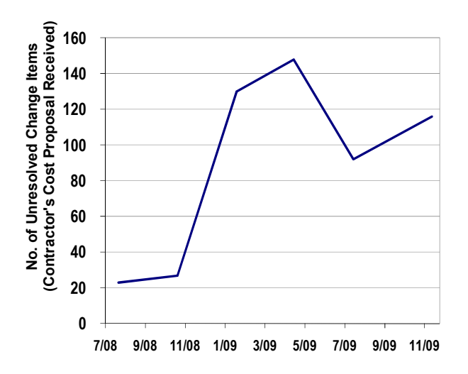
Figure 3. Number of Unresolved Change Items

Figure 3 shows the number of unresolved change items<sup>3</sup> on a quarterly basis from July 2008 through September 2009. A previously observed decrease between April and July 2009 corresponds to WTD's report of added resources. The number of unresolved change items has increased since July 2009 primarily due to new RCOs and RCPs for the IPS and Solids contracts.