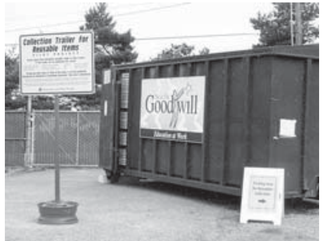
▲ The Reuse Collection Project in cooperation with Seattle Goodwill at the First Northeast Transfer Station