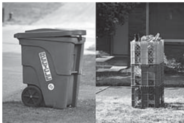
▲ Primary recyclables are collected at the curb

The private solid waste management companies that provide curbside collection services in the region are required to collect these materials, at a minimum. Drop boxes that serve the rural areas, operated by the County or cities, must also accept these materials.