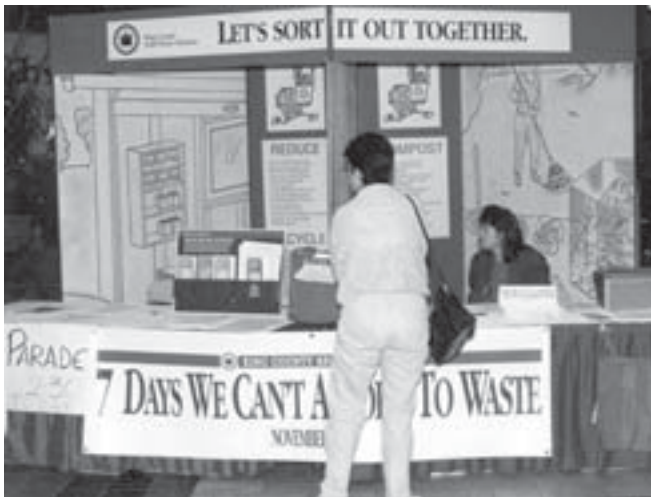
▲ Recycle Week programs encourage the public to improve their recycling habits and to practice waste reduction

It soon became clear, however, that it was difficult to accurately measure the two very different activities of reduction and recycling with a single, combined numerical goal. First, it is difficult to quantify waste that is never generated when successful