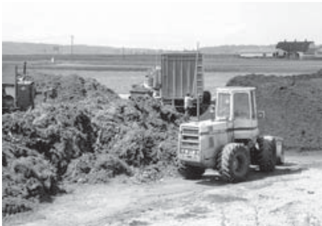
▲ Several private companies operate organic-material processing facilities in King County

ing the night shift. At the public meetings conducted during Plan development, citizens expressed a strong desire for more recycling services at the transfer stations.