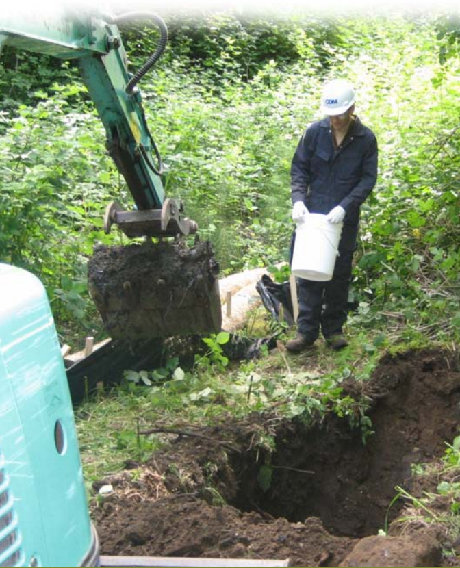
Collecting soil samples at Ellisport Creek on Vashon Island

The King County Brownfields Program provides assistance to qualified private individuals and businesses, nonprofit organizations and municipalities within King County to assess and clean up contaminated sites, also known as Brownfields. Types of assistance include: