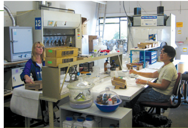
Soil analysis in the lab

and Phase II assessments on eligible sites. King County can also request that the U.S. Environmental Protection Agency (EPA) Region 10 office use its consultants to conduct Phase I and Phase II assessments. Both CDM and EPA can also recommend cleanup approaches and estimate cleanup costs.