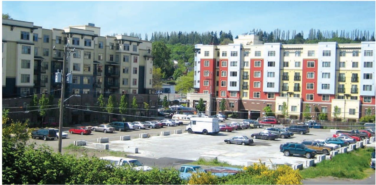
Rainier Court redevelopment project before and after assessment and cleanup