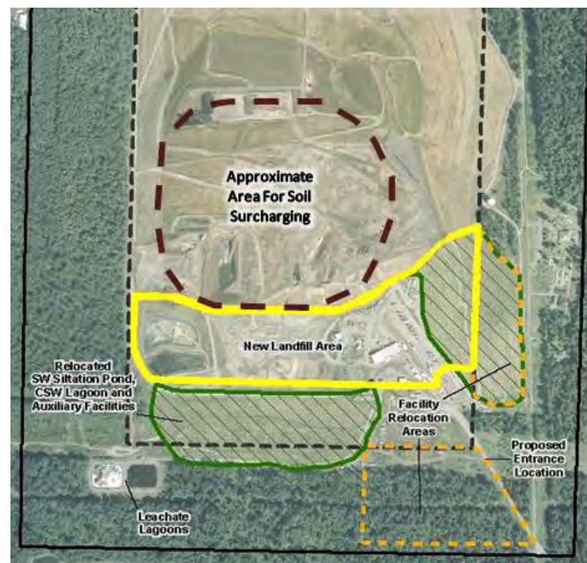
Alternative 4 (withdrawn as discussed in Section 4.1)