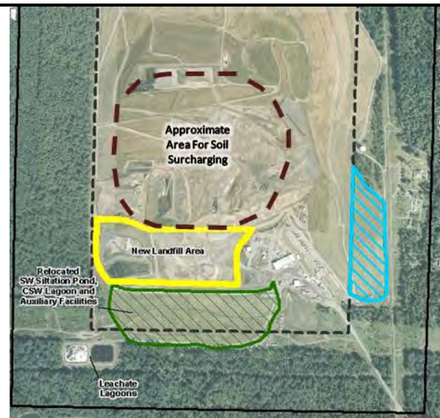
Alternative 2 (preferred alternative)