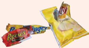
Candy wrappers, chip bags