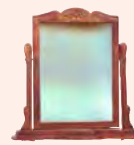
Windows and mirrors