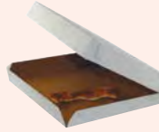
Pizza boxes and other food-soiled paper