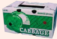
Wax-coated cardboard boxes