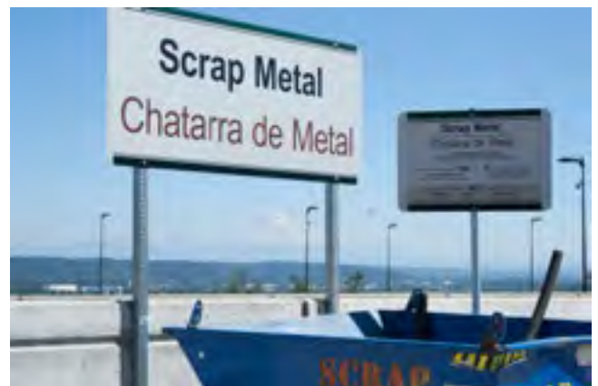
Scrap metal recycling Bow Lake Recycling and Transfer Station