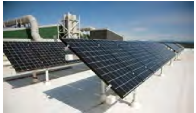
Rooftop solar panels at Bow Lake Recycling and Transfer Station