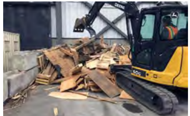
Stockpile of untreated wood for recycling at Factoria Recycling and Transfer Station