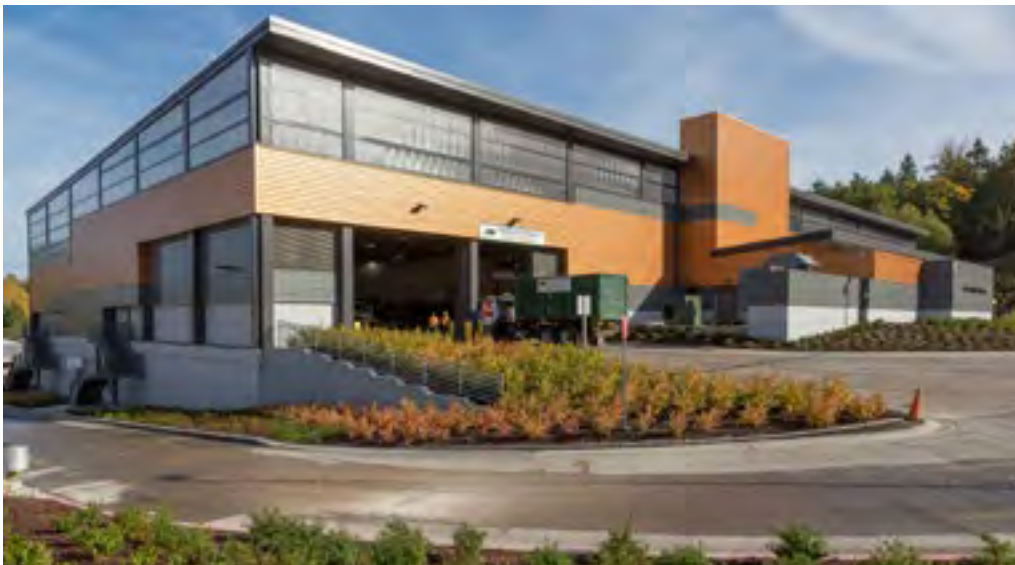
Factoria Recycling and Transfer Station

The Siting Advisory Committee (SAC) is a community-based committee that will advise King County on how and where to site the new station. The committee will have up to 28 members. King County will appoint 22 members from government agencies, non-profit groups, businesses, and interest groups in the siting areas. The six remaining seats will be open for interested community members to apply.