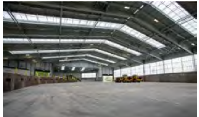
Skylights and translucent windows at Bow Lake Recycling and Transfer Station