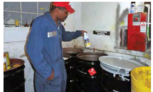
A household hazardous waste (HHW) transfer station operator sorts HHW