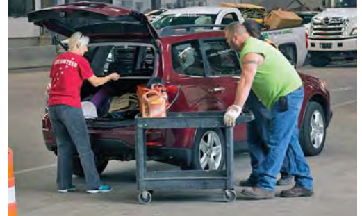
New transfer building has large self-haul customer unloading areas.