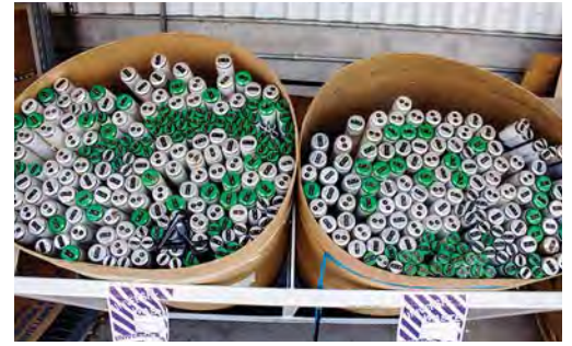
Fluorescent lights and other mercury-containing bulbs and tubes are collected for recycling.