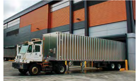
Transfer trailers haul garbage from Factoria to landfill.