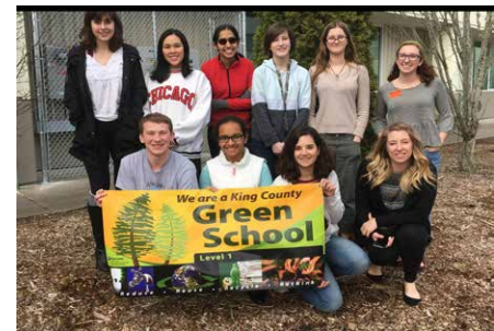
Student Green Team members proudly show their King County Green Schools banner.

Level Three of the Green Schools Program: Achieved in May 2019