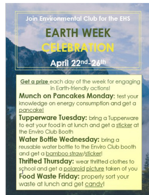
Earth Day celebration poster