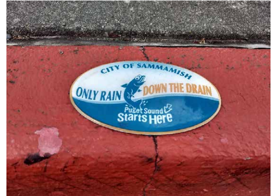
Storm drain stencils