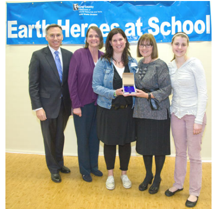
Island Park's principal, teachers and a student accept King County award in April 2011.