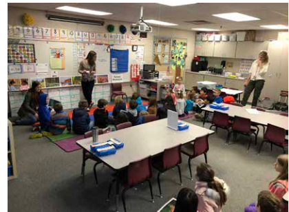
Students learn about habitats and natural resources.