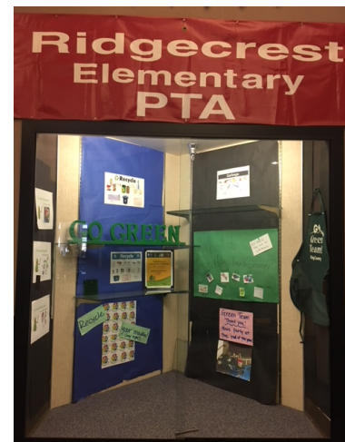
The PTA Green Team display case located near the front

Level Two of the Green Schools Program: Achieved in May 2018