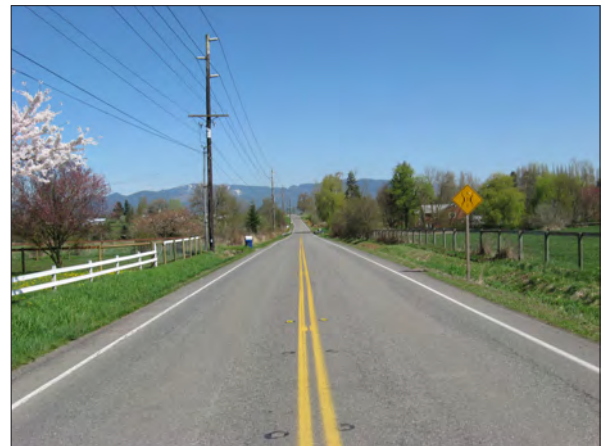
SE 416th St (before paving)