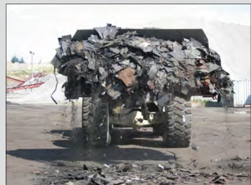
Whole shingles not yet sorted for use in paving demonstration

A detailed list of acronyms, abbreviations, and key terms is included in Appendix A.