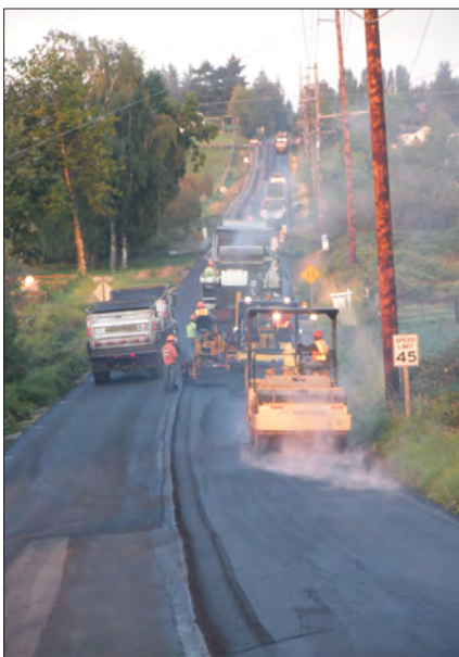
Paving in process at SE 416th St near Enumclaw, Washington

The paving demonstration results indicate that the RAS contributed a greater amount of asphalt binder to the final HMA product than anticipated. Both Woodworth and WSDOT suspect that double grinding the RAS, which was needed to meet the RAS gradation specification, enabled more of the RAS-embedded asphalt to be released and effectively utilized in the HMA than originally predicted. Further research and analysis is necessary to confirm this hypothesis.