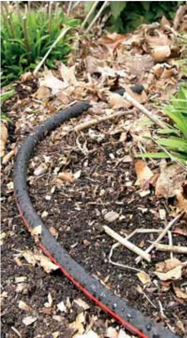
Soaker hoses save water! Cover them with mulch to save even more.

For lawns, a loss of shine or footprints showing indicate that it's time to water. Vegetables and other annuals should be watered at the first sign of wilting, but tougher perennials (plants that live several years) only need water if they stay droopy after it cools off in the evening. Trees and shrubs usually don't need any watering once their roots are fully established (2 to 5 years), except in very dry years.