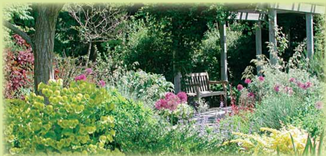
Waterwise Garden at the Bellevue Botanical Garden.