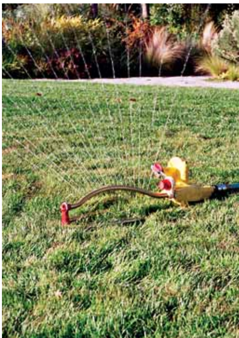
Water in early morning or evening to reduce evaporation.