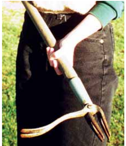
Long handled weed pullers pop dandelions out easily.