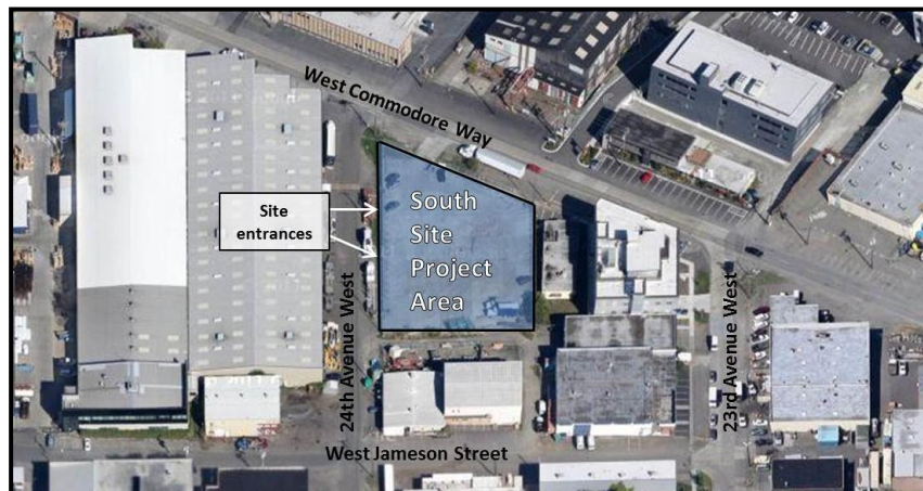
South Site Project Area