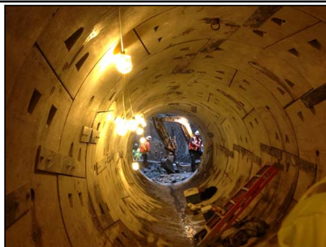
Looking through the tunnel towards the north shaft in Ballard

King County urges drivers and bicyclists to continue to use caution near the site. Pedestrians in Ballard should follow sidewalk detour signs around the north site ( see map ).