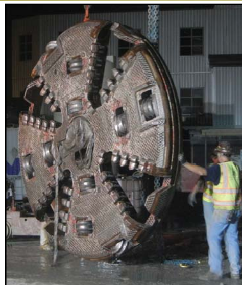
The tunnel boring machine cutter head