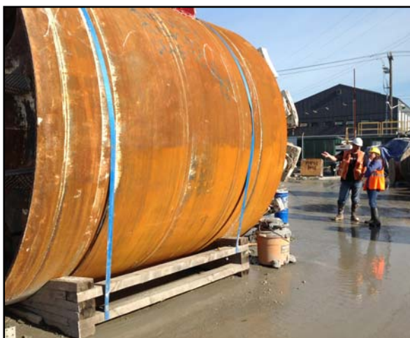
The tunnel boring machine after tunneling