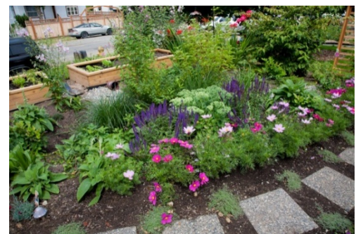
Rain garden on private property

RainWise will be available to homeowners in the Barton basin starting this spring. This voluntary program provides rebates of up to 100% to homeowners who install a rain garden and/or cistern on their private property to manage stormwater runoff. Watch for a letter in the mail with information about RainWise and how to sign up. Learn more at www.rainwise.seattle.gov .