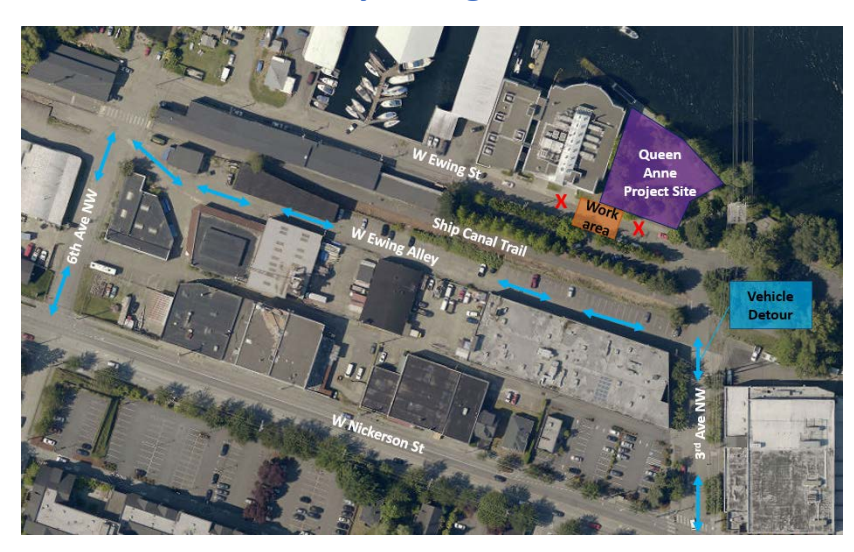
Traffic can detour to the W. Ewing Alley when W. Ewing St. is closed