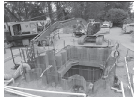
MTBM access shaft

Some late night work, lasting about a week, may be required in late August or early September, while the new sewer is microtunneled under Northeast Juanita Drive.