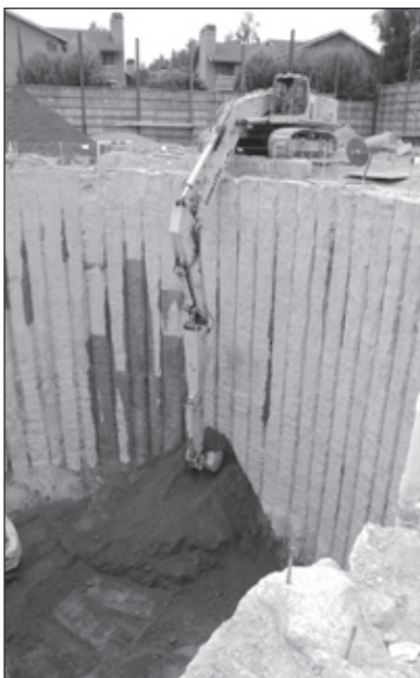
Crews excavate soil to build pump station foundation

During the last two months, crews have excavated over 10,000 cubic yards of soil as part of constructing the new pump station foundation. The base of the pump station is located approximately 55 feet below street level. In addition, a 25-foot-wide by 40-foot-deep access shaft was excavated in the staging area to accommodate the microtunnel boring machine (MTBM).