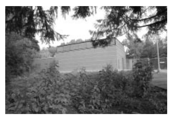
Landscaping with native plants enhances the Thornton Creek riparian corridor