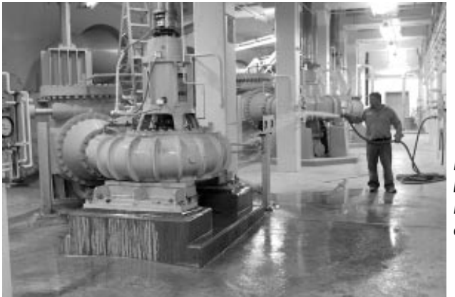
New pumps help ensure reliable future operation