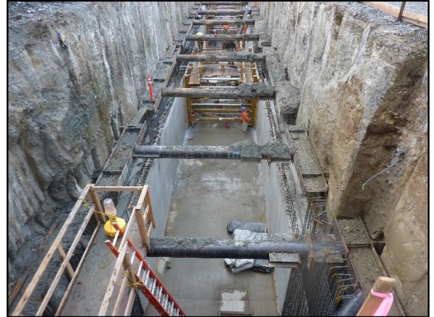
Recently completed concrete work on underground storage tank.