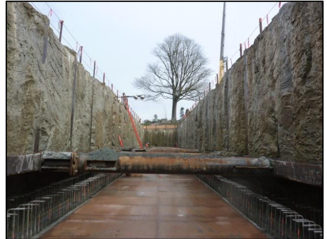
Crews prepare to continue forming and pouring the top of the CSO tank.