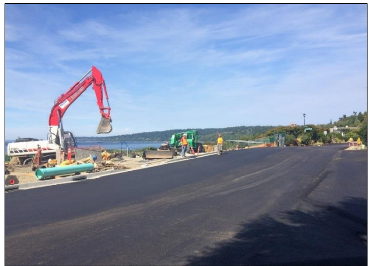
Intersection on August 26, 2015. Crews are preparing the intersection for reopening on Monday, August 31.

Map on reverse shows new intersection layout.