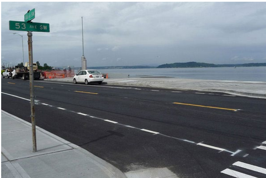
The pump station is located at 53rd Avenue Southwest and Alki Boulevard.