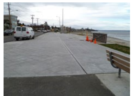
Facility access hatches are located next to the pedestrian and bike way along Alki Avenue.