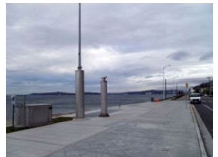
King County designers worked with neighbors and property owners to help plan the above-ground structures required for the upgraded facility. Air circulation vents, a generator stack, a fire hose hook up, and a backflow preventer are the only above ground features.