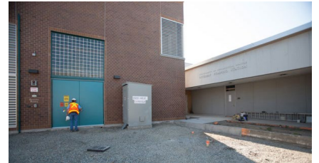
The new generator building was completed in summer 2012. The standby generator provides emergency backup power when there is an interruption in utility power feed.