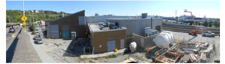
The Interbay Pump Station is located near the intersection of W Garfield St and 15th Ave W. Photo taken September 2012.