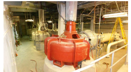
The first pump was replaced in 2012. The other two pumps were replaced in 2013 and 2014.