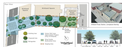
Plan view of improvements. Source: Spring 2011 project update ☐

Contact South Treatment Plant at ☐ 206-263-1760 ☎.