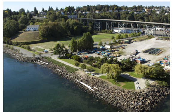
CSO Tank Site Location

In 2008, King County reported that the South Magnolia CSO facility had 19 overflows per year on average that discharge a total of 31 million gallons of untreated wastewater and stormwater into Puget Sound off of South Magnolia. King County is working to meet current regulations set by the Washington Department of Ecology that require no more than one untreated discharge per year on a long term average.