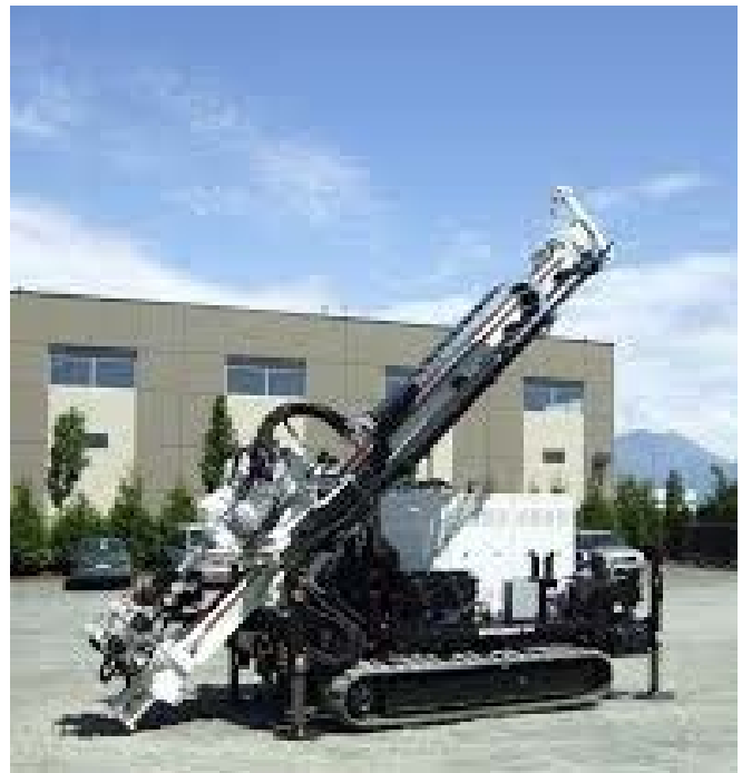
Crews will use a drill rig to confirm the pipe break's location. Grout will be pumped into any areas of soil loss along the damaged pipe