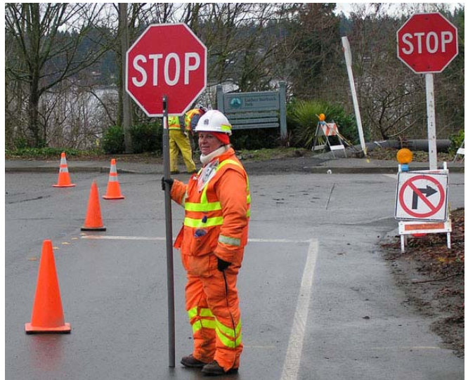
Traffic flaggers will detour cars, bikes and pedestrians around the work area

King County will share more information about its plans to repair the pipe after confirming the pipe break location and stabilizing any areas of soil loss along the pipe.