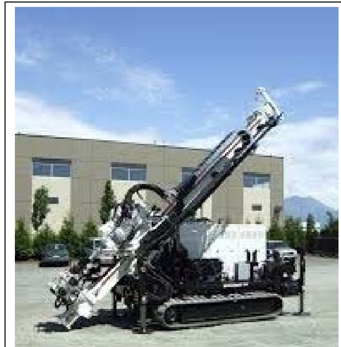
Two small drill rigs help crews confirm the pipe break's location. Any areas of soil loss found along the damaged pipe are filled with grout.

King County must repair a damaged pipe designed to send flows to the County's Magnolia Wet Weather Storage Facility. The pipe and facility work together to keep sewage and stormwater out of Puget Sound during storms and prevent Combined Sewer Overflows (CSOs).