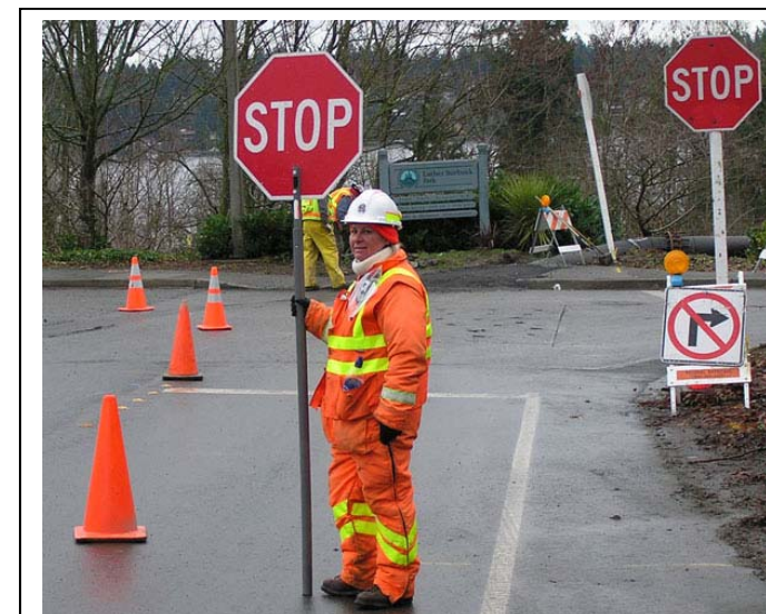
Traffic flaggers will detour cars, bikes and pedestrians around the work area