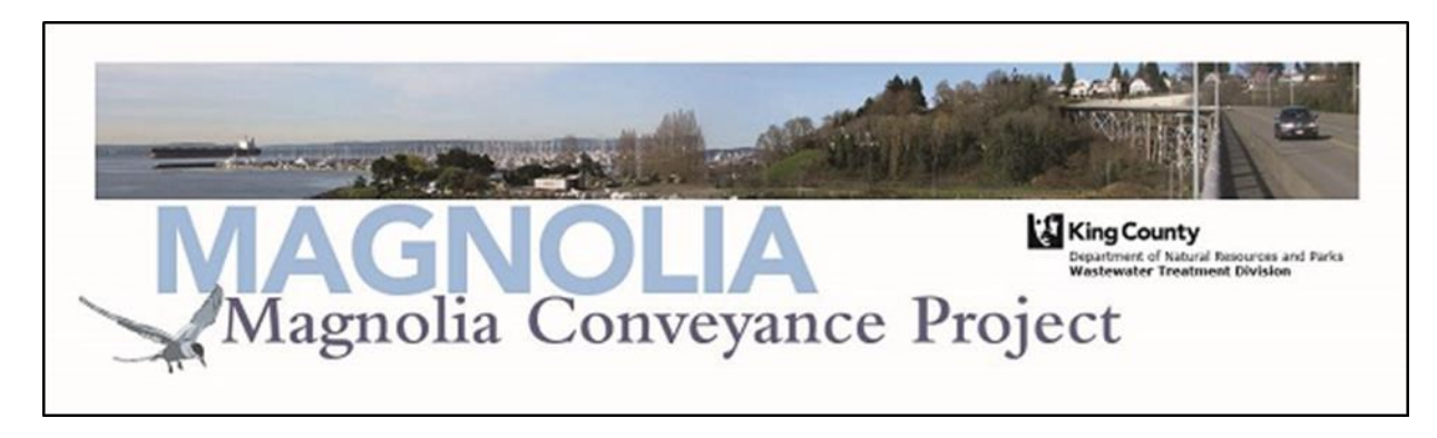
November 27, 2017

King County's contractor for the <u>South Magnolia</u> <u>Conveyance Project</u> is beginning work to restore pipeline operations for the Magnolia Wet Weather Facility. This facility was designed to store excess flows of stormwater and wastewater in large storms, reducing combined sewer overflows (CSOs).