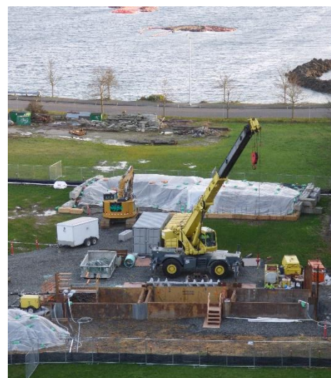
Crews will secure the excavation in Smith Cove Park and continue to prepare the pipe.

The schedule and duration for construction is tentative and is subject to change as work progresses. We will continue to provide email notices with updates on timing of specific construction activities.