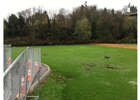
Grass is getting established on the athletic fields in Smith Cove Park