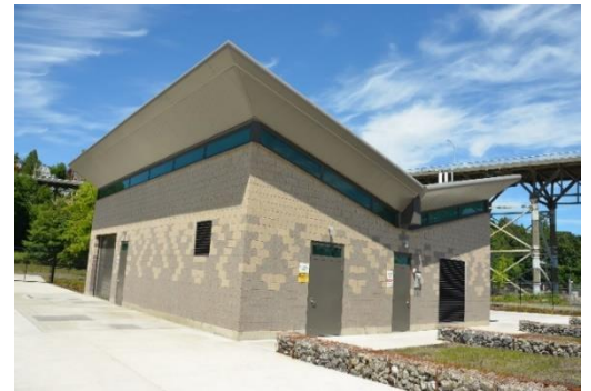
The Magnolia Wet Weather Storage Facility in Smith Cove Park.

King County's contractor is working with Seattle Parks and Recreation to finalize restoration plans for areas of Magnolia Park by the construction site. Final restoration on 32nd Avenue West is expected to take place in early 2019.