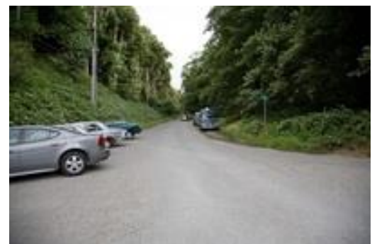
Restoration on 32nd Avenue West.